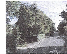
Approach from Standish

Directions from the North Leave the M61 at junction 8 and follow signs to Chorley on the A6. Pass B & Q, McDonalds, Chorley Train Station and Morrisons and follow the A6 towards Bolton. Pass the Yarrow Bridge Hotel on the Left and at the second set of Traffic Lights take the right turn into A5106 Wigan Lane towards Wigan. Wigan Lane Playing fields are approx. 1mile away on the right