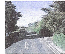
Approach from Chorley